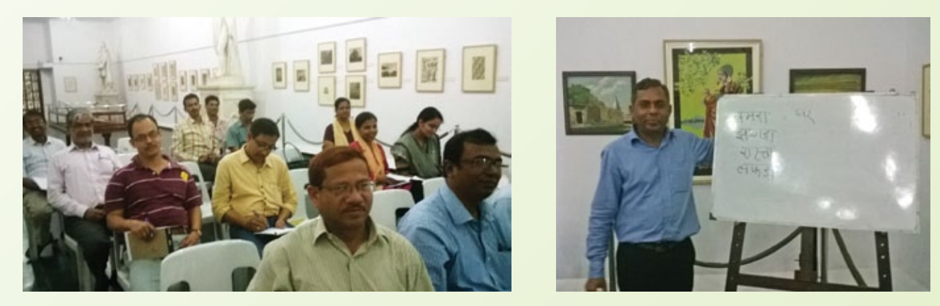
In-house Hindi Workshop (20 December 2013 and 24 March 2014)