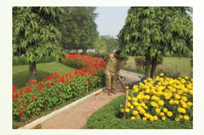
Work on upkeep of Victoria Memorial Gardens