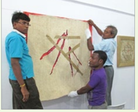
Work on Mounting of an Exhibition