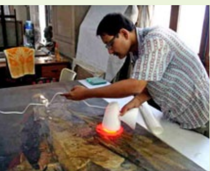
Work on Restoration