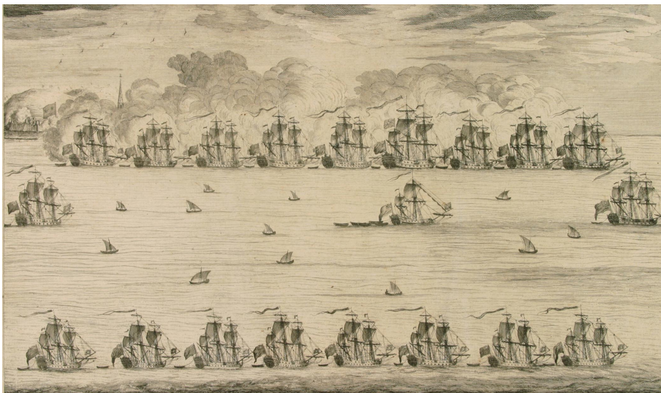
Pondicherry attacked by the British Fleet, under Admiral Boscawen, 1748, VM Collection

The archive has rare collections, e.g. Justice Hyde's manuscript diary, early colonial documents on 18th and 19th centuries Calcutta / Bengal, land records in Urdu and Persian, and a number of old Supreme Court records.