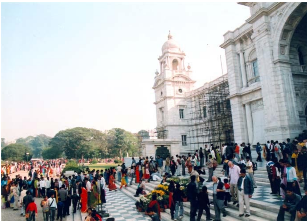
The Memorial in the winter months