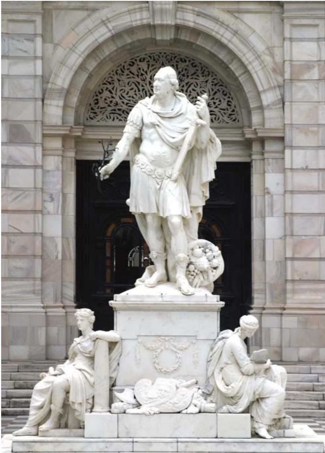
Marques Cornwallis, marble statue by John Bacon on view at the Eastern Quadrangle