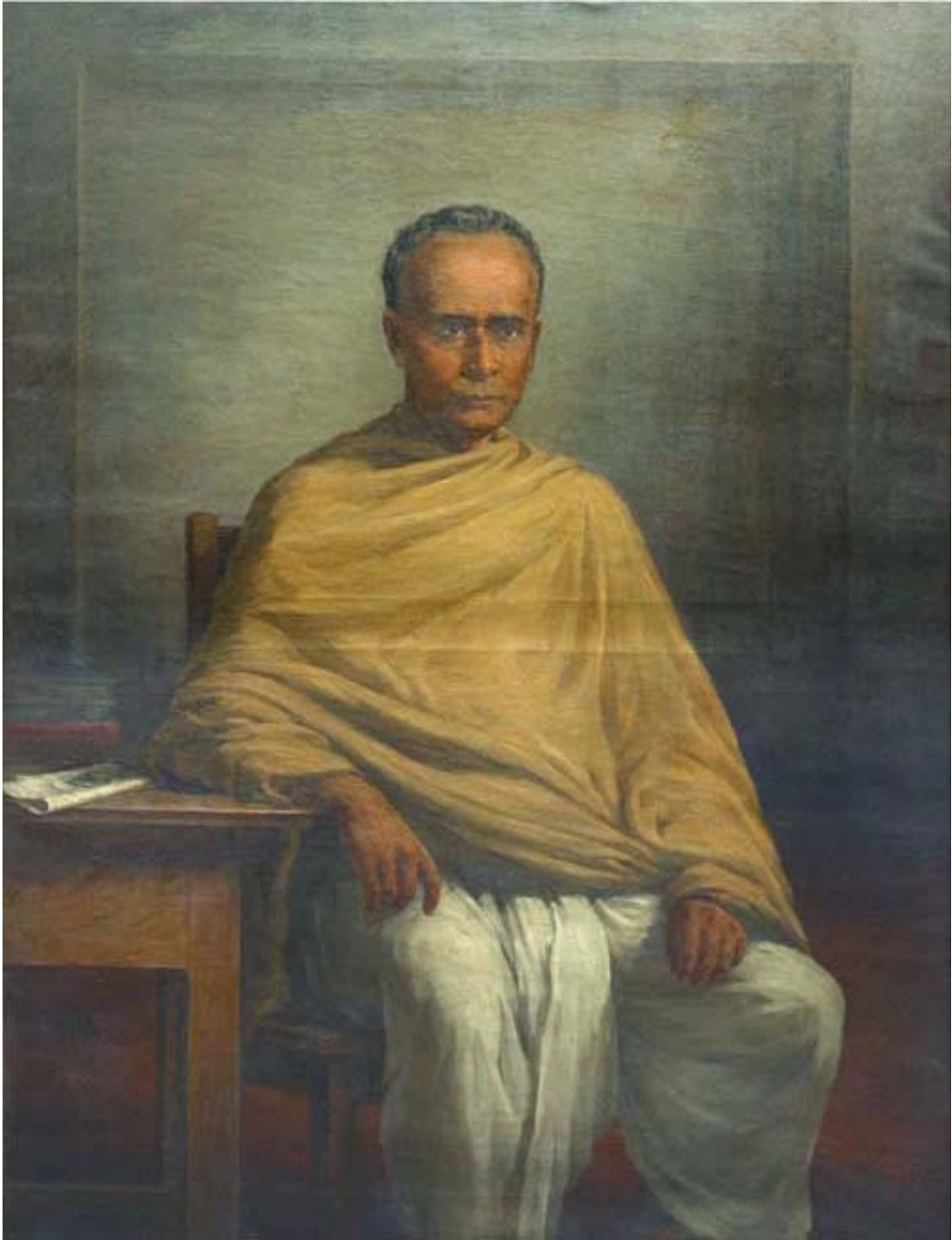
Iswar Chandra Vidyasagar by Atul Bose, Oil on Canvas on view at Calcutta Gallery