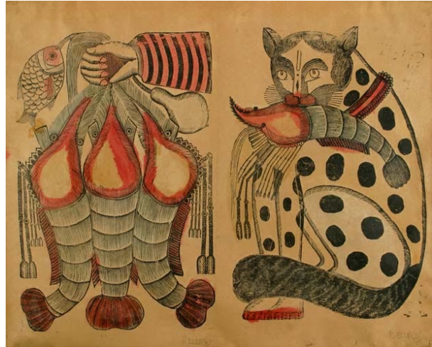
Bunch of Lobster & Cat with Lobster, on view at Calcutta Gallery

The unique encapsulated history extending over three centuries is preserved with great care. Planned restructuring of the galleries has recently been taken up in order to portray the historical significance of the Memorial in a more attractive visual and descriptive form to more than one million visitors a year. The splendour of the Memorial attracts visitors from all over the country and outside, including a large number of visitors from neighbouring countries of Bangladesh, Nepal and Sri Lanka. The number of visitors from Europe, North America and Asia is significant.